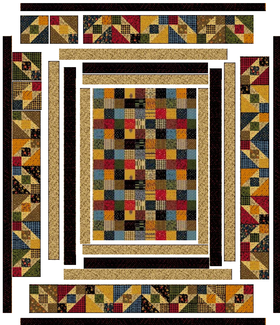
Quilt Assembly Diagram